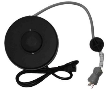
Optional Retractable Cord reel

Optional integrated storage | wire management baskets